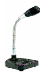
Omnidirectional Condenser Microphone